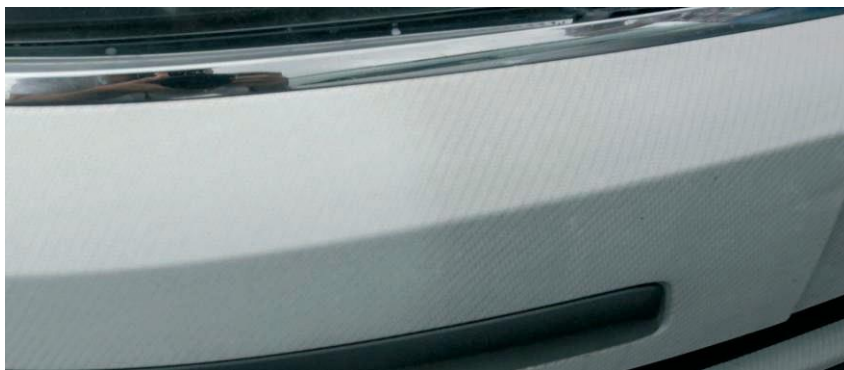
Left, result after cleaning – Right, situation before cleaning

Especially the white carbon films are very sensitive to dirt. This is not only because they are white, but also because of their structure. On the picture you can see a bumper, wrapped with a white carbon film about 15 months ago, which has regularly gone through a car wash. Even though the vinyl has been cleaned regularly with a standard car shampoo, the dirt has penetrated deep into the microscopic pores of the