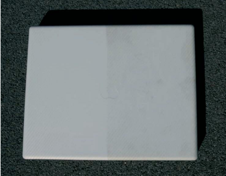
Left, result after cleaning – Right, situation before cleaning

Furthermore we have done some testing on a laptop. After having used the wrapped laptop for more than 1 year, we tried to clean the white carbon film. Only a few cleaning products showed any result at all, none of them proved to be satisfactory. After using a melamine sponge, the result was magnificent.