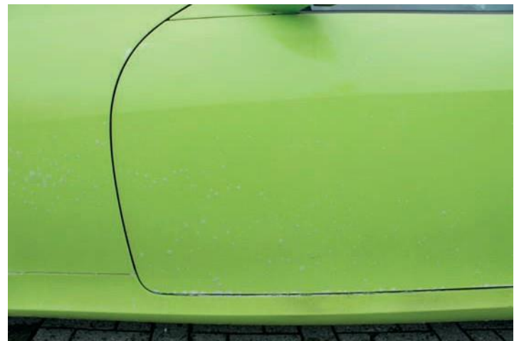
Clean the car with a good car shampoo and rinse it with water

No combination with other cleaning products is needed, protecting users from prurigo.